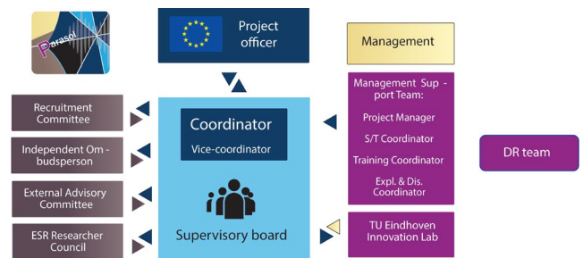
Figure 3: PARASOL Project Management Structure

In case not all 12 DRs can be recruited during the collective Recruitment Event, the recruitment procedure is "decentralized", meaning that the involved supervisors continue the search for good candidates. The RC is kept always informed when new eligible candidates appear. The RC makes an official complaint in case the Code of Conduct for the Recruitment of Researchers is breached. The involved supervisor is then expected to find another candidate. Recruitment problems are also, if still needed, discussed during the first PARASOL Network Wide Events (M6, M12) to deliver specific action plans to target specific networks relevant for the vacant DR positions.